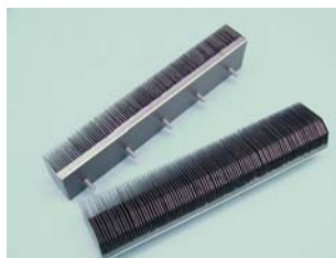
Multi Module Heatsinks