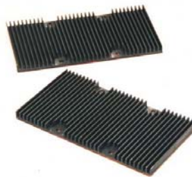
Low Profile Heatsinks