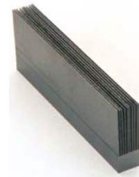
Thin Profile Heatsinks

This information is not to be taken as a warranty of representation for which we will assume legal responsibility nor permission or recommendation to practice any patented invention without license. It is offered solely for your consideration, investigation and verification. eGraf™ is a trademark of Graftech Inc.