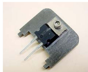
Thermal Coolers TO-220 Power Package